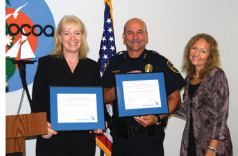
HFI received the MetLife Community-Police Partnership Award.

Additionally, HFI focuses efforts on neighborhood revitalization, to include last year's partnership with local police at the Crestwood Villas to make security enhancements and community improvements that resulted in national recognition through winning a MetLife Community-Police Partnership Award. In FY 2010, the Melbourne Neighborhood Stabilization Program (NSP) grant from the City of Melbourne provided additional resources for homeownership in Brevard County.