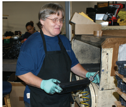
Abilities secured a contract to replace toner cartridges.